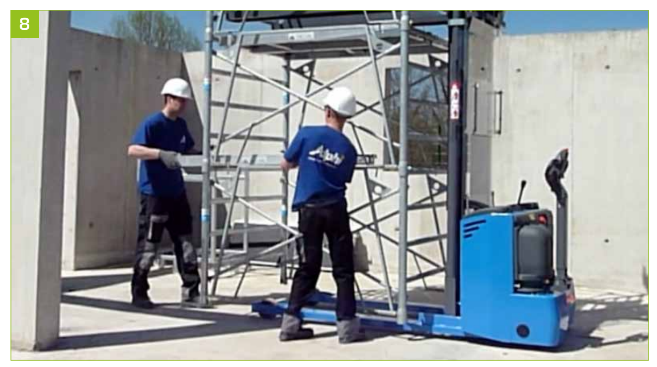
- Repeat operations 4 to 7 to the desired height.