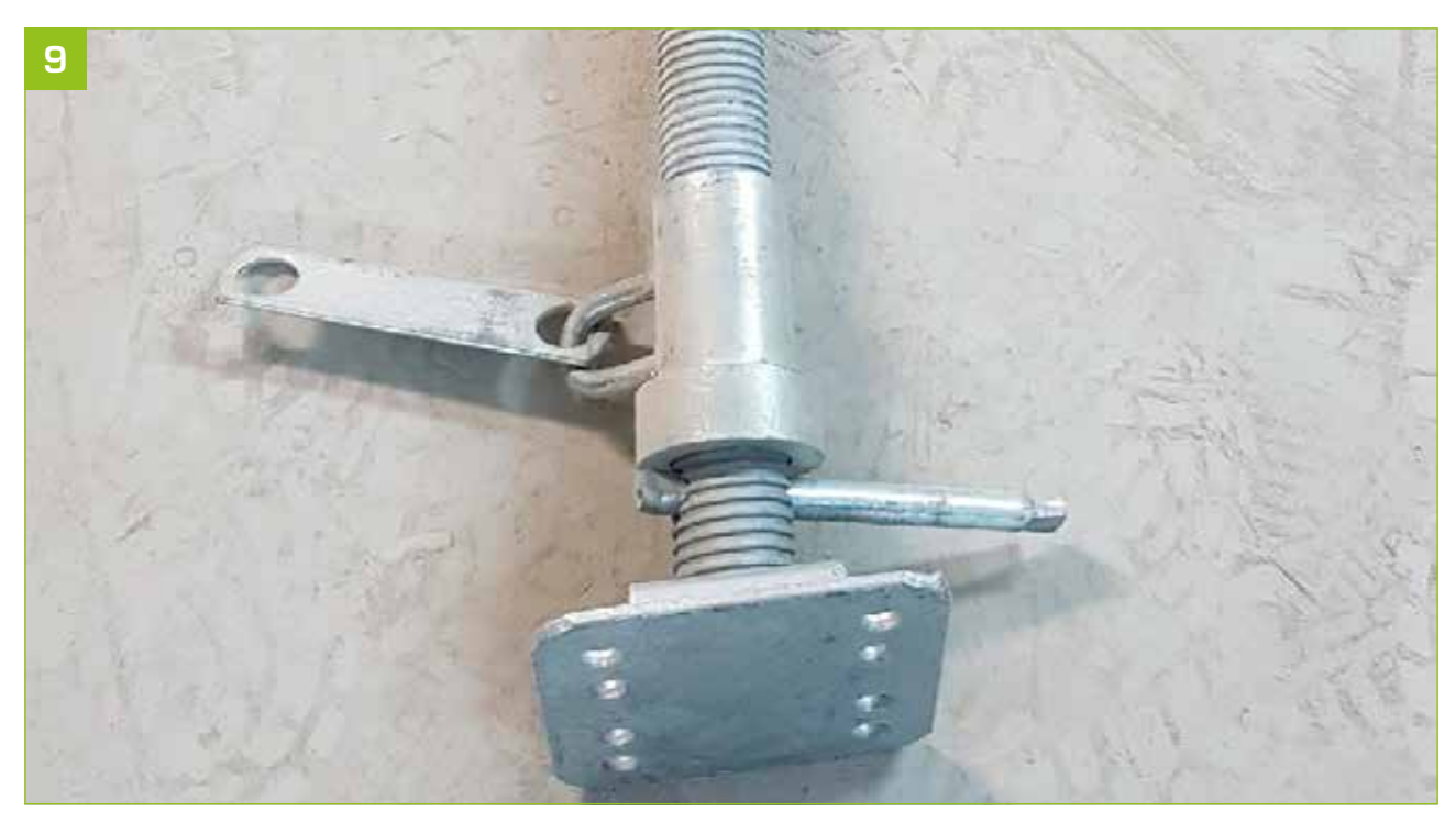
- Pre-set and position the base jacks on 1.5 metre ladders.