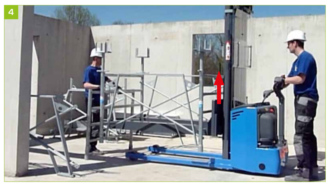
- Using the Monte-Tour, raise the first level until you can insert a second 1 metre ladder.