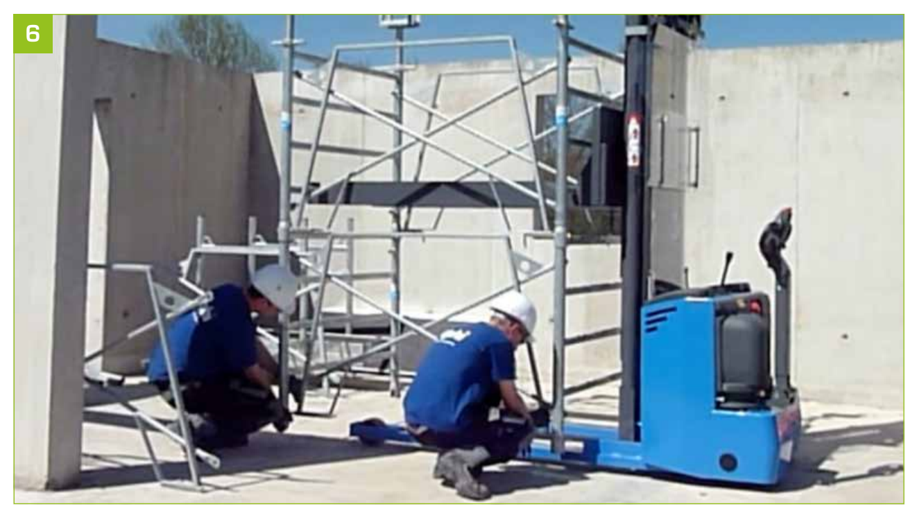
- Assemble the guardrails: ensure that the tilting studs lock (automatic).