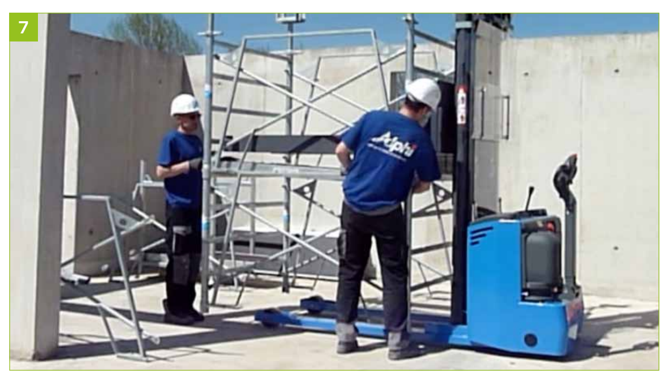
- Position the working planks in the tower.