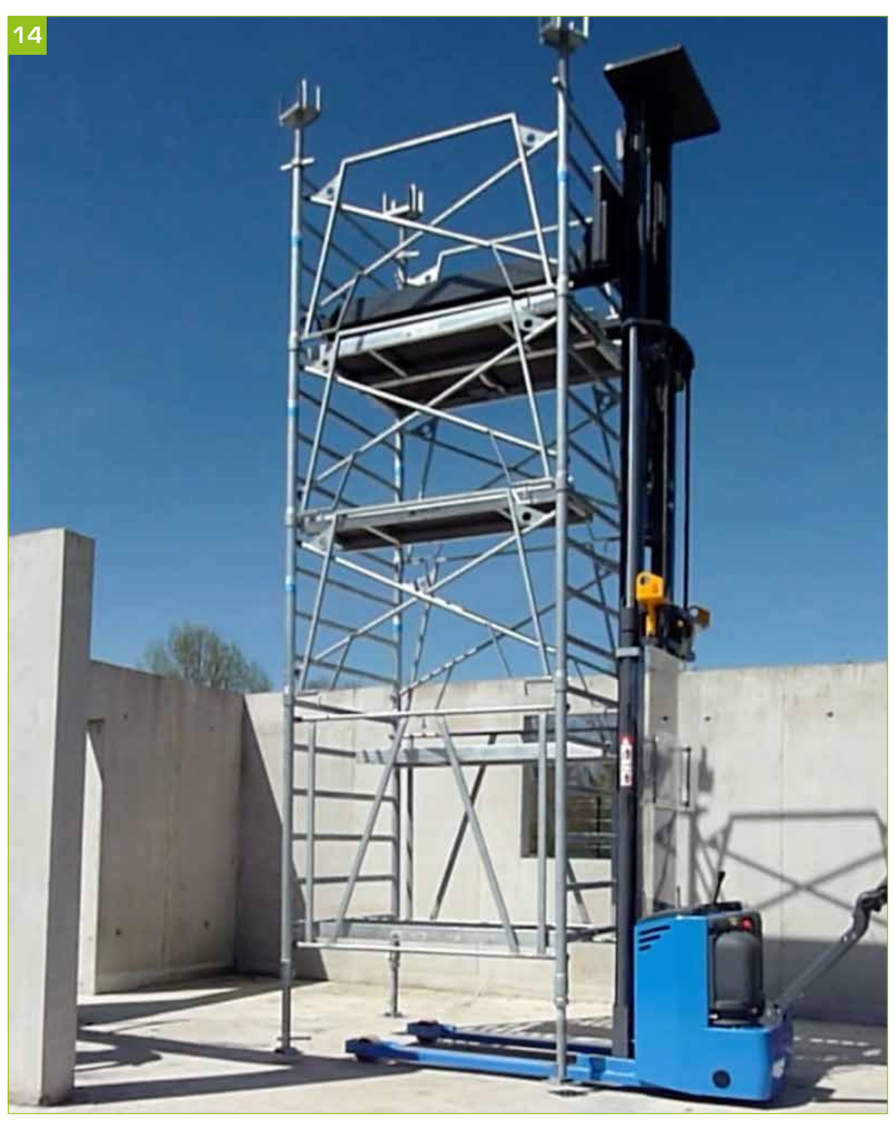
- The tower can then be craned or translated to its final position using the \mbox{Monte-Tour}.